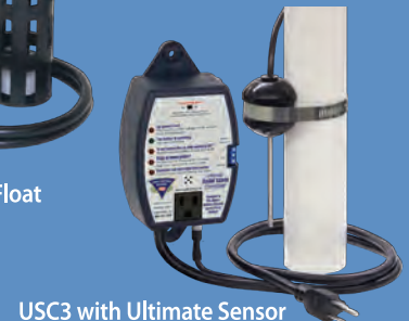
USC3 with Ultimate Sensor

Industrial Grade for the Residential Market