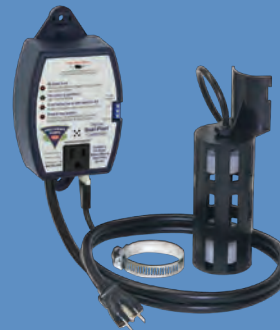
DFC2 with Dual Float